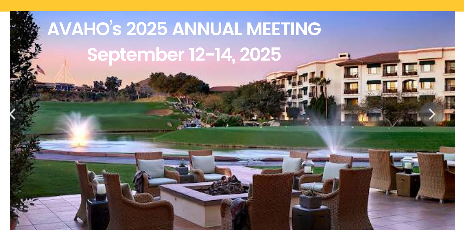
Arizona Grand Resort and Spa, Phoenix, AZ